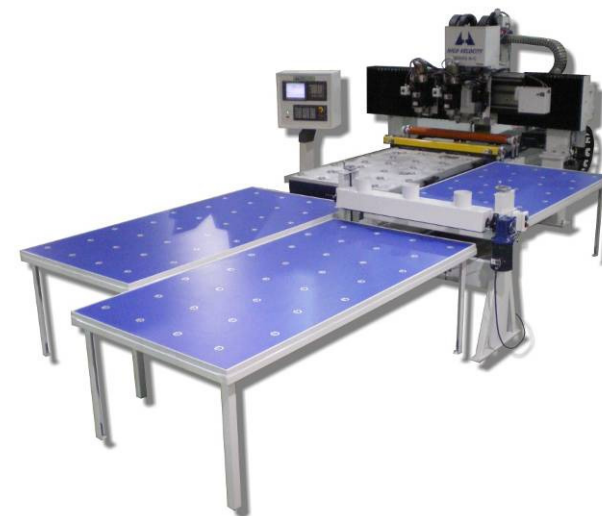
Above: (3) 4x8' auxiliary pressurized flotation ball tables arranged around a High Velocity Accu-Router. Shown with optional "Accu-Sweeper" between rightmost tables for removing sawdust from carrier panel as it re-circulates for another cycle